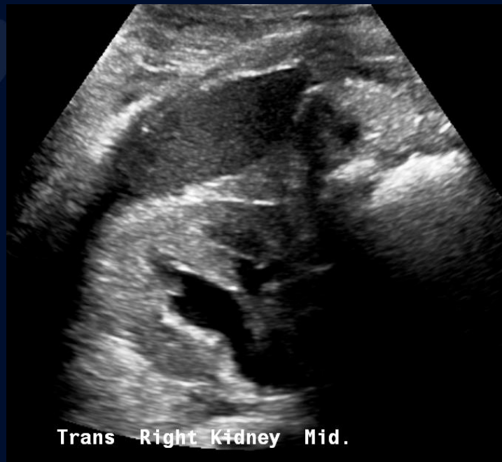
Trans Right Kidney Mid.