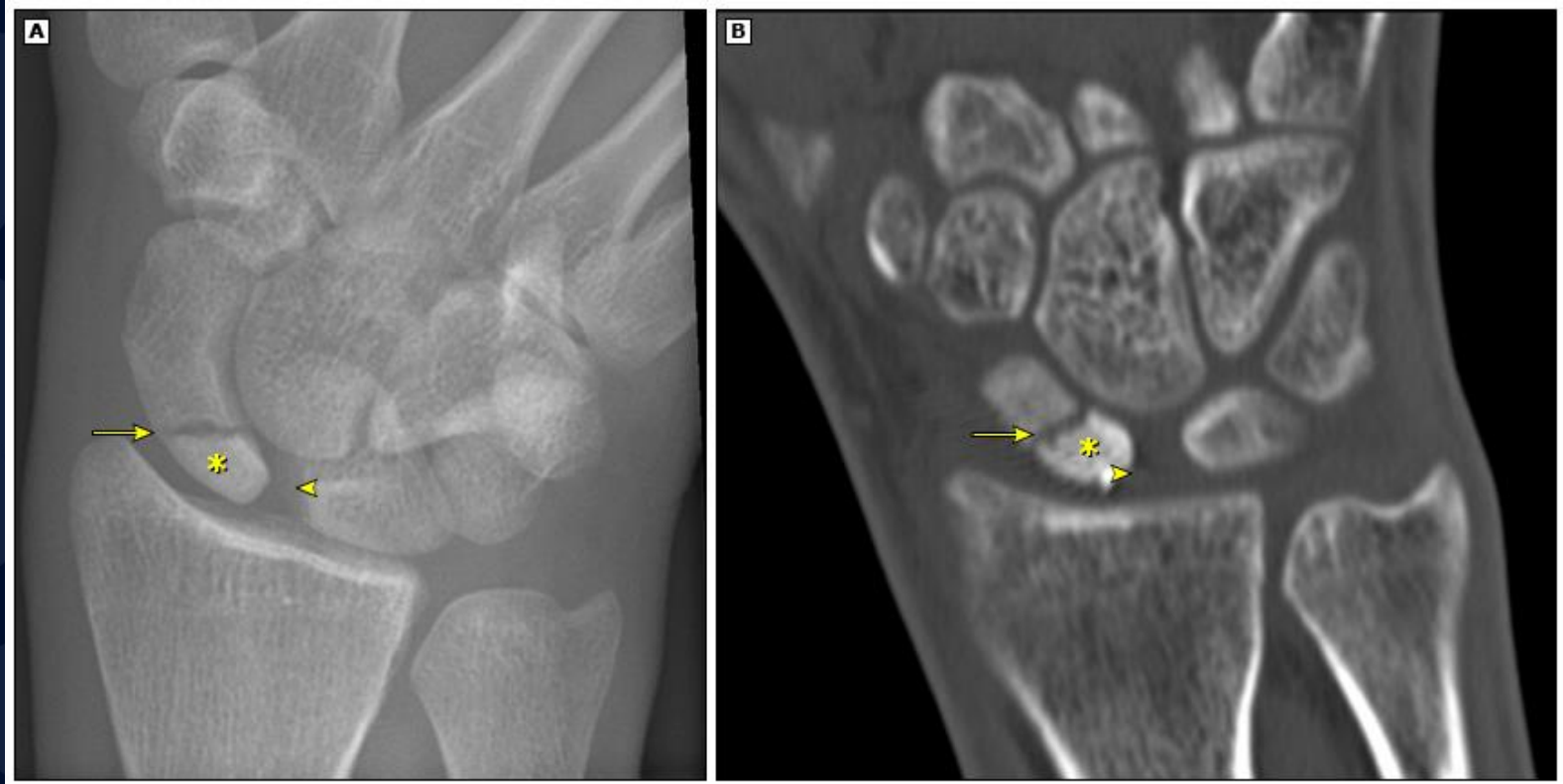
Scaphoid view radiograph (A) and CT scan (B) showing nonunion (arrow) and avascular necrosis (asterisk) and the Terry Thomas sign – scapholunate ligament injury (arrowhead).