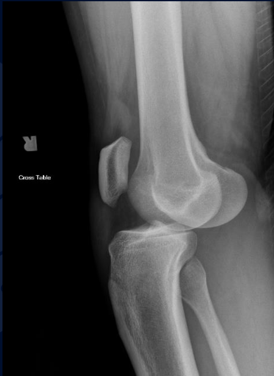
Lateral View R Knee