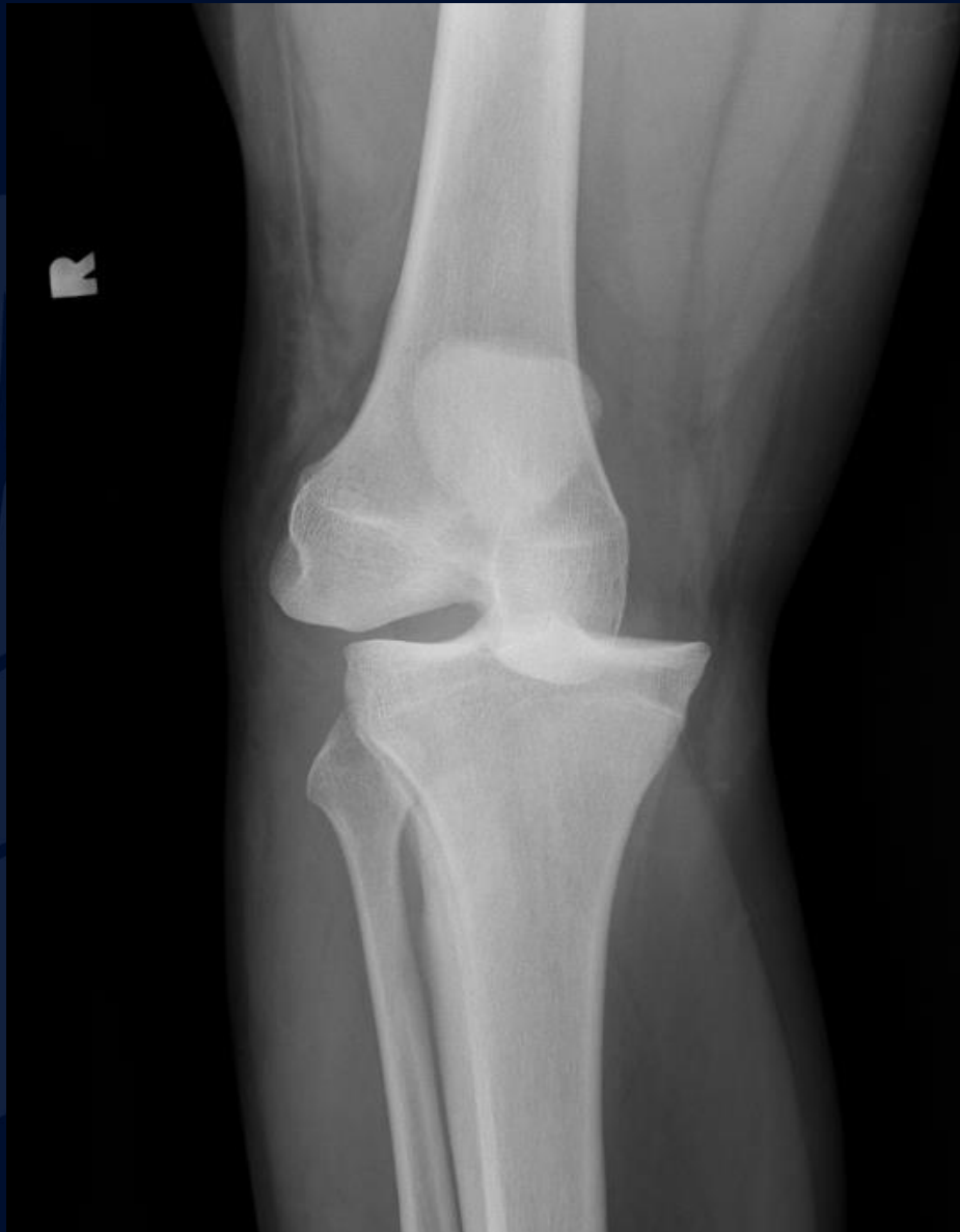
Frontal View R Knee