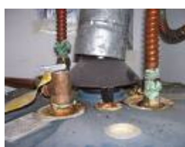
Top of Water Heater