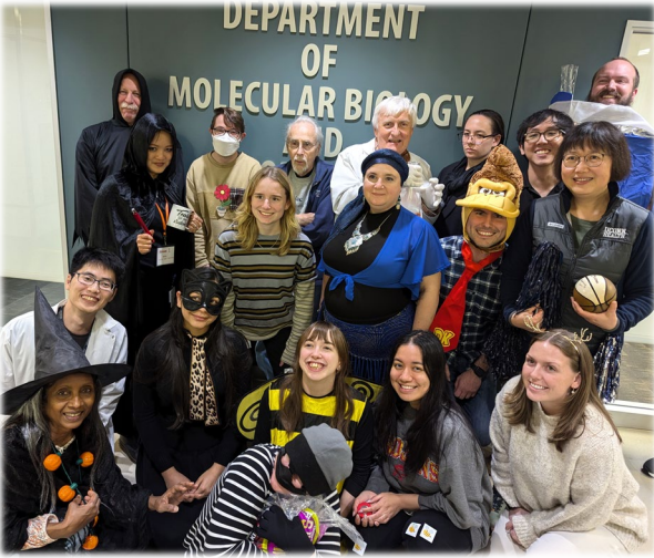
The Molecular Biology & Biophysics Department's MBB Bees Knees were a Halloween treat!

Students, faculty and staff have been out and about over the past few months! Here's a peek at some of the things they've been up to!