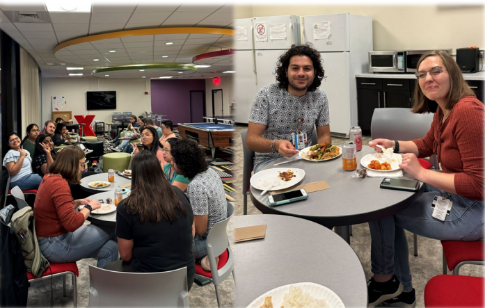
GSO July Trivia Nite in the Student Lounge