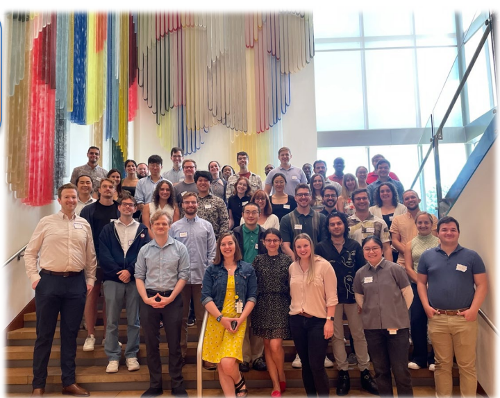
The MD/PhD program retreat at the New Britain Museum of Art in August