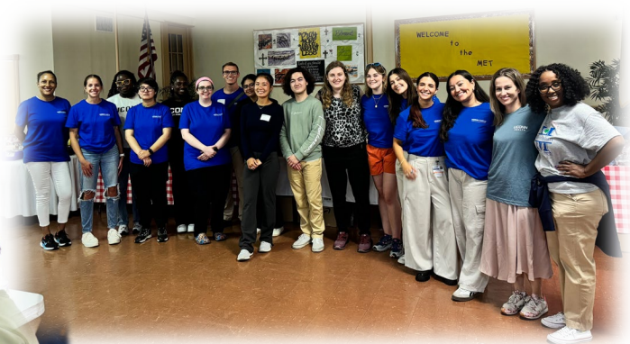
In August, incoming students in the Program in Applied Public Health Sciences partnered with AME Zion Church, Hartford to sort & prepare items donated by Amazon for the Community Store where they are distributed at no cost to the Greater Hartford community.