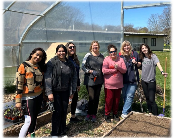
Program in Applied Public Health Sciences students & staff planting wildflowers at local schools for Earth Day