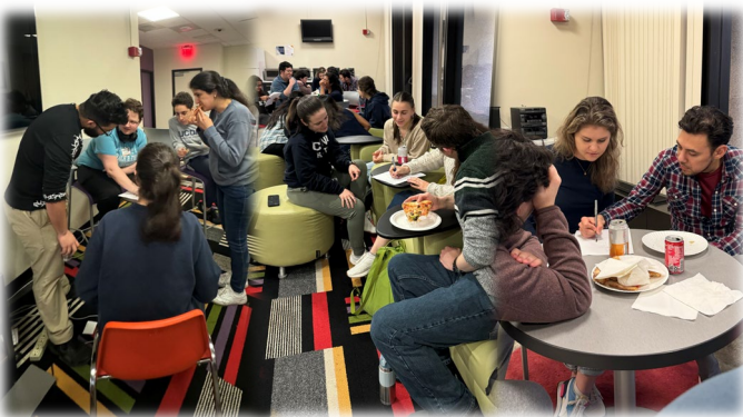
GSO April Pizza and Trivia Nite in the Student Lounge