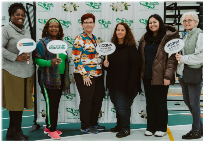
Students & faculty in the Program in Applied Public Health Sciences at the Black Family Wellness Expo at Weaver High School in Hartford, where they were sponsors of the event dedicated to empowerment, education, & holistic wellness.