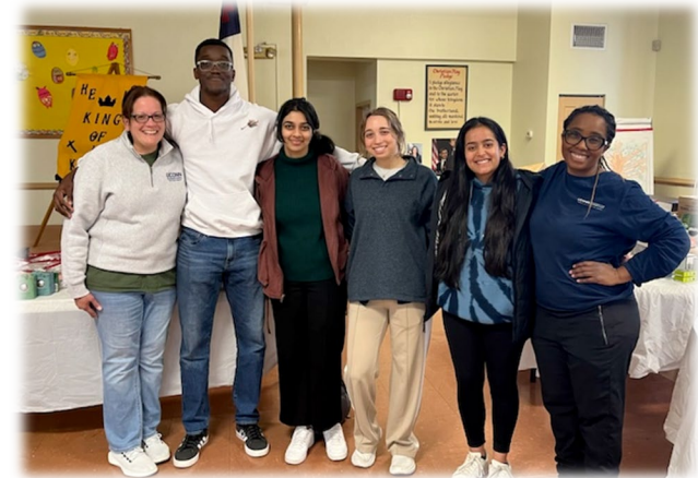
Students in the Program in Applied Public Health Sciences sorting & organizing Amazon donated supplies for the Community Store at Metropolitan AME Zion Church, Hartford