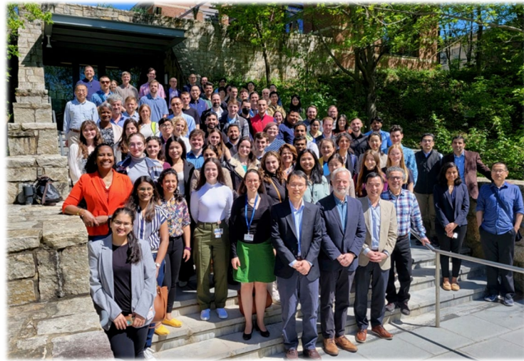
Neuroscience Dept. retreat at the Mark Twain House in May