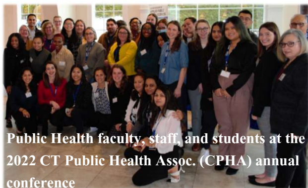
Public Health faculty, staff, and students at the 2022 CT Public Health Assoc. (CPHA) annual conference