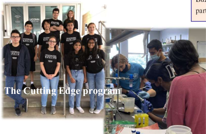
The Cutting Edge program