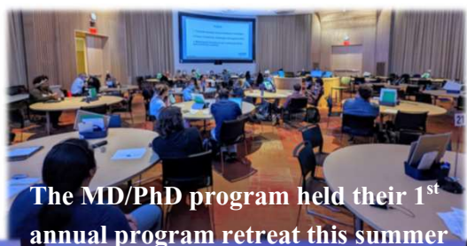
The MD/PhD program held their 1 st annual program retreat this summer