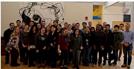
36 PhD Candidates 7 MD/PhD & 1 DMD/PhD candidates