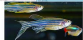
Diverse Model Systems