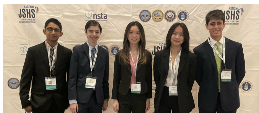
Connecticut's delegation at the 2025 National Junior Science and Humanities Symposium

Connecting students to careers, professionals to communities and communities to better health