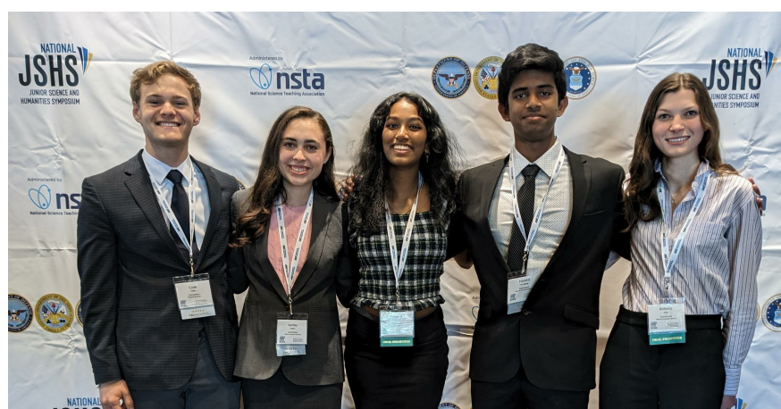
Connecticut's delegation at the 2024 National Junior Science and Humanities Symposium

Connecting students to careers, professionals to communities and communities to better health.