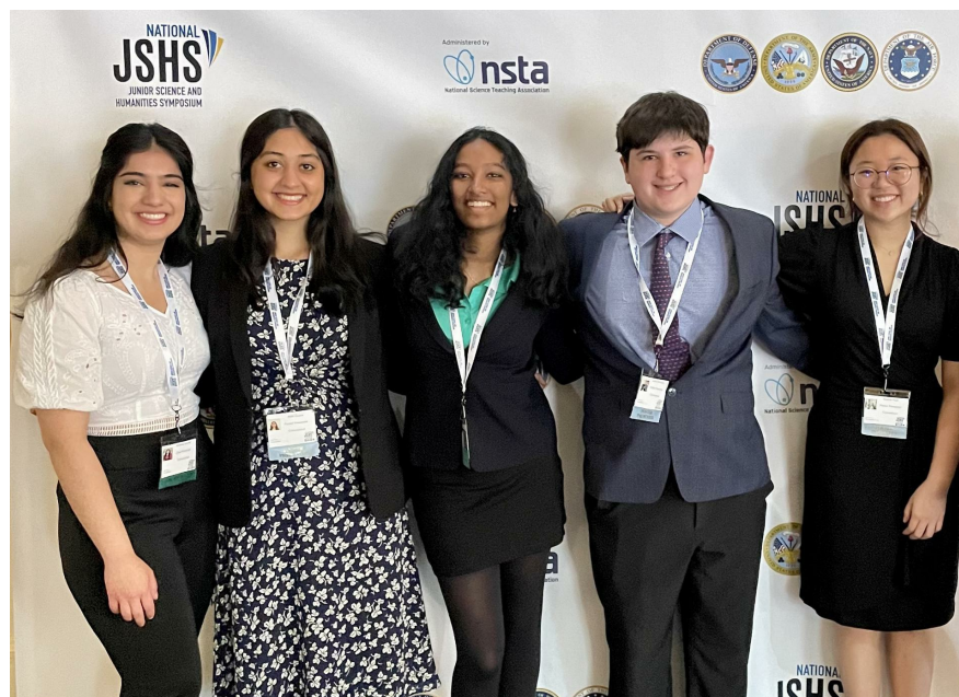
Connecticut's delegation at the 2023 National Junior Science and Humanities Symposium

Connecting students to careers, professionals to communities and communities to better health.