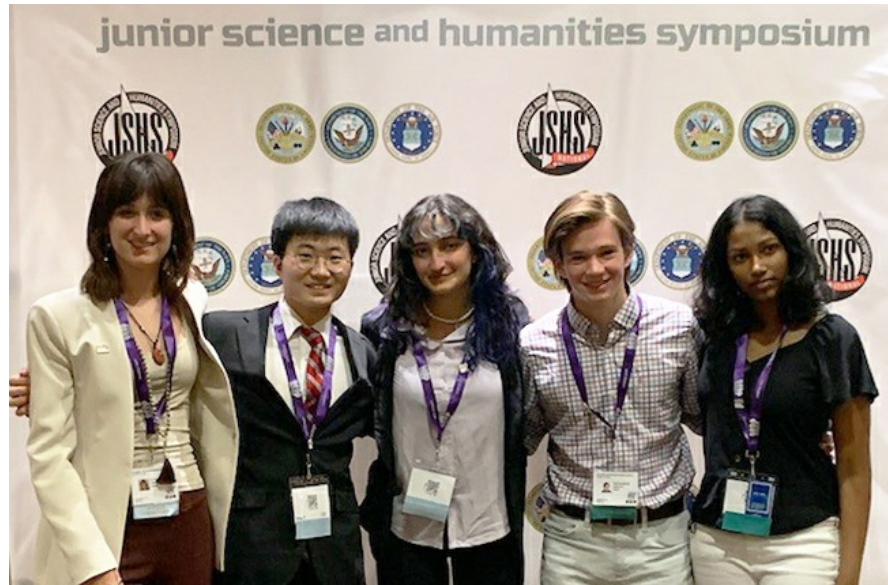
Connecticut's delegation at the 2022 National Junior Science and Humanities Symposium

Connecting students to careers, professionals to communities and communities to better health.