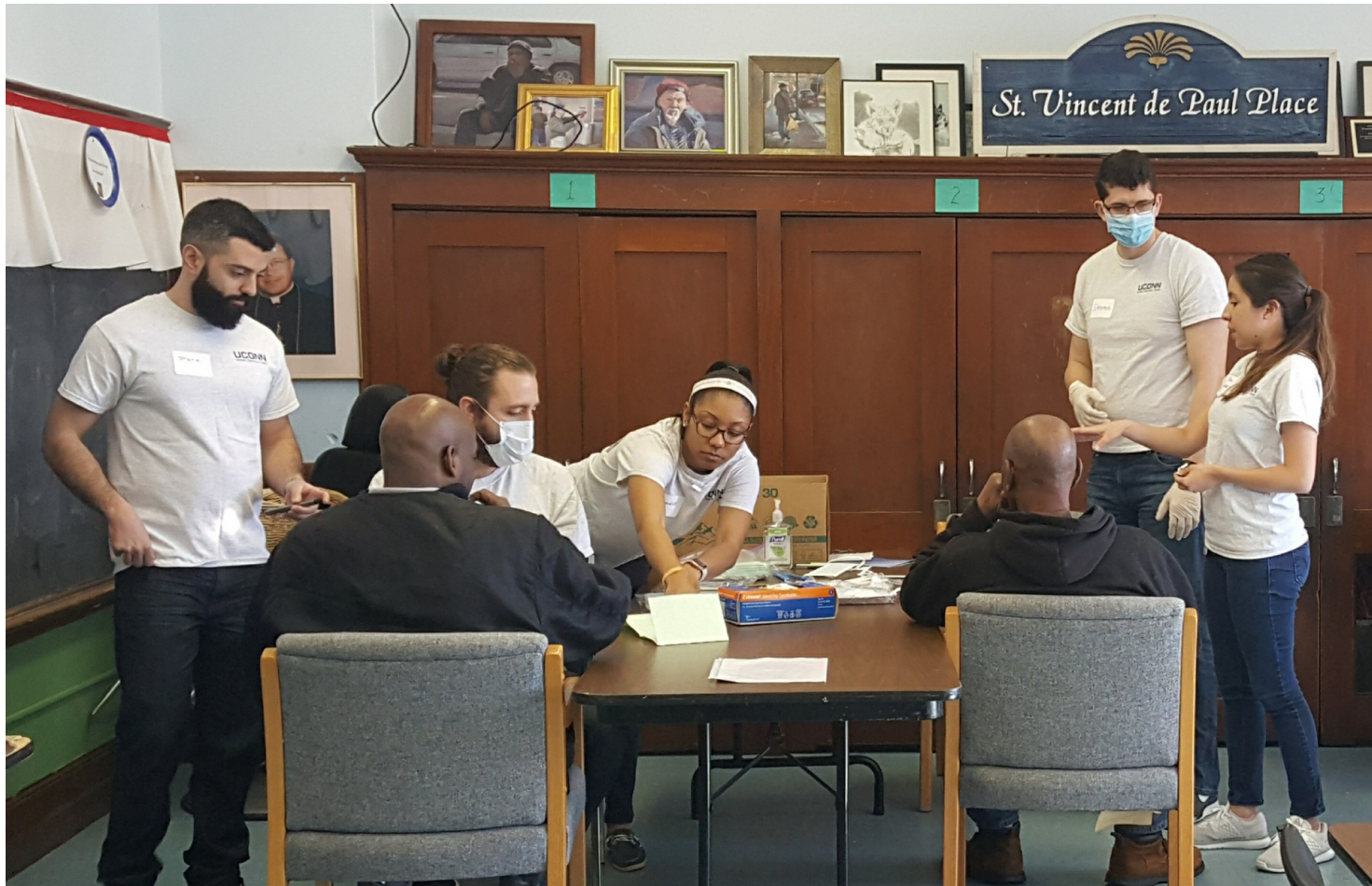
Health professions students serve community members at St. Vincent de Paul Place in Norwich

Connecting students to careers, professionals to communities and communities to better health.