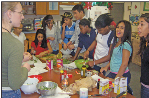
Pathways/Senderos and UConn UST participants prepare a feast!

(UST). UST is a large group of over 100 medical, dental, nursing and pharmacy students from UConn. They volunteer to educate inner-city youth about personal health and proper nutrition.