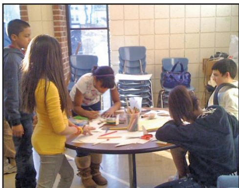
Pathways/Senderos' artists hard at work on their projects.