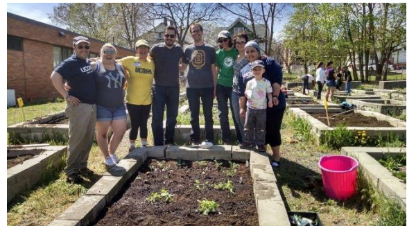
Public Health Student Organization tending to the community gardens in Hartford

https://www.facebook.com/UConn.PHSO/videos/vb.80469869525/10154057398719526/?type=2&theater