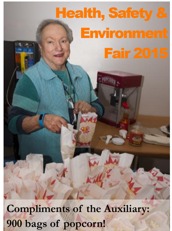
Compliments of the Auxiliary: 900 bags of popcorn!

card, and most of all, the satisfaction of helping support the Auxiliary and our programs! Limited exclusions apply.