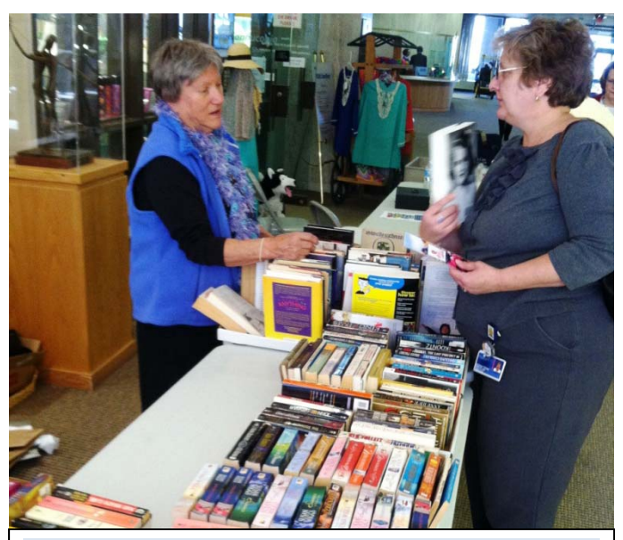
In September, we had a sell-out Mum Sale and a very successful Book/Cookies Sale.